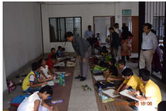
Additional Director General, DoE and Project Director of ODS Projects is inspiring the children on the painting competition