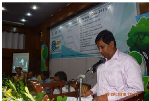
Mr. Tipu Sultan MP is delivering his speech

support in implementing these projects. He wished the implementing agencies to work together with the government for the protection of ozone layer as well as other environmental issues. He also informed the house that due to unavoidable circumstances the observance of IOD shifted from 16 th September to 29 th September. He congratulated the winners of various events on the occasion of World Environment Day 2016 and International Ozone Day 2016.