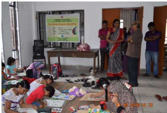
A view of Children's Painting Competition on eve of IOD 2016