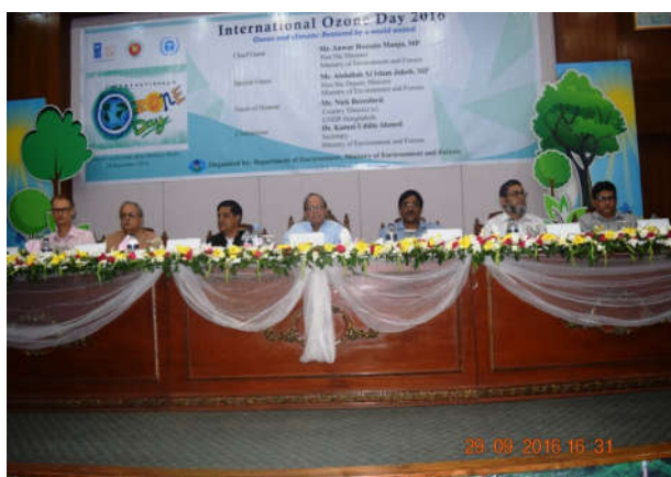
Hon'ble Guests of the IOD 2016 Programme