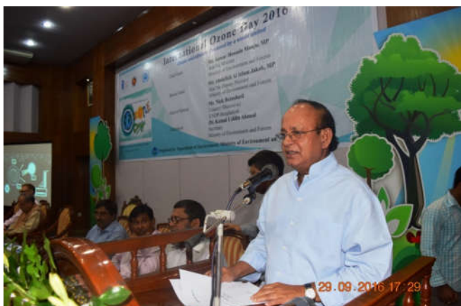
Hon'ble Minister for Environment and Forests Mr. Anwar Hossain Manju MP is delivering his speech

Hon'ble minister for Environment and Forests Mr. Anwar Hossain Manju, MP in his address, stressed upon the need for creating awareness on the importance of ozone layer protection and possible impacts on earth's living creatures caused by ozone layer depletion. He also reiterated the commitment of Bangladesh Government to phase-out remaining ODSs from the