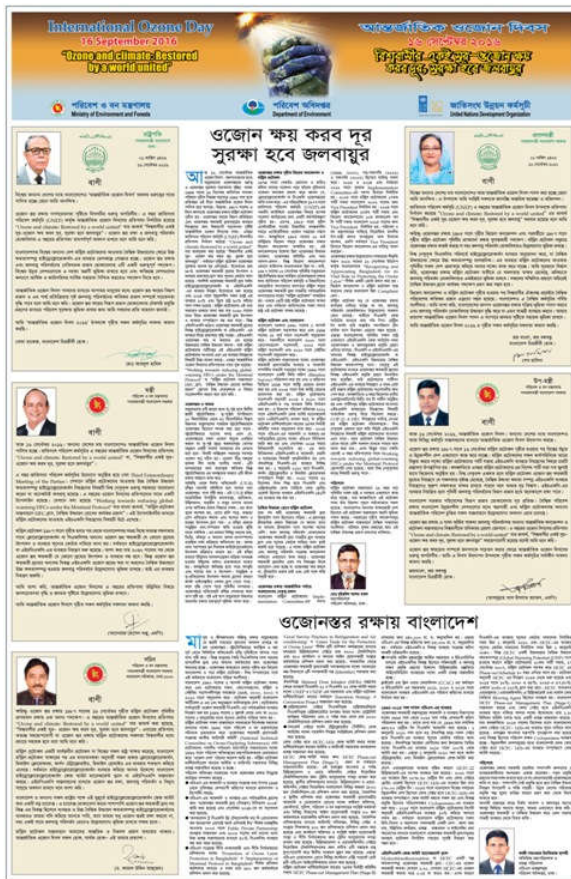
Special supplement published in the daily news paper

Special supplement was brought out in two major dailies on the occasion of International Ozone Day on 16 September 2016. His Excellency President of the People's Republic of Bangladesh Md. Abdul Hamid , and Hon'ble Prime Minister, Government of the People's Republic of Bangladesh Sheikh Hasina gave separate messages highlighted the importance of day and urged to work unitedly to protect ozone layer and combat climate change. Hon'ble Minister for Environment and Forests Mr. Anwar Hossain Manju , MP and Hon'ble Deputy Minister for Environment and Forests Mr. Abdullah Al Islam Jakob , MP also gave messages on the occasion.